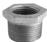
Pārejas gredzens MF