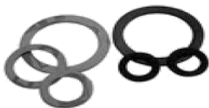
Savienojuma gumijas blīves