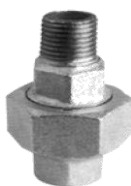
Izjaucams savienojums FM