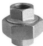
Izjaucams savienojums FF