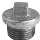
Kokšis ar ārējo vītņi M